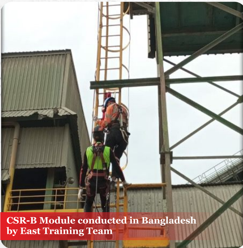
CSR-B Module conducted in Bangladesh by East Training Team